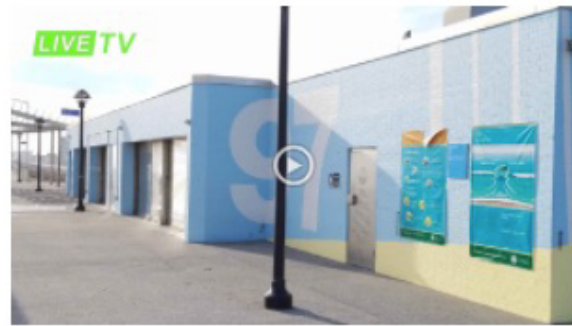
LIVE TV 2