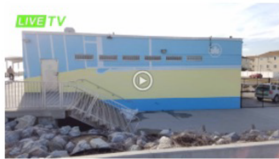
LIVE TV 1